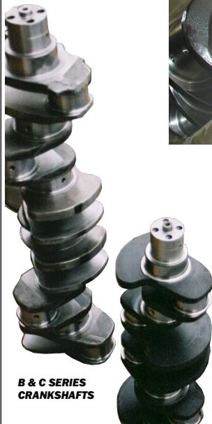
B & C SERIES CRANKSHAFTS